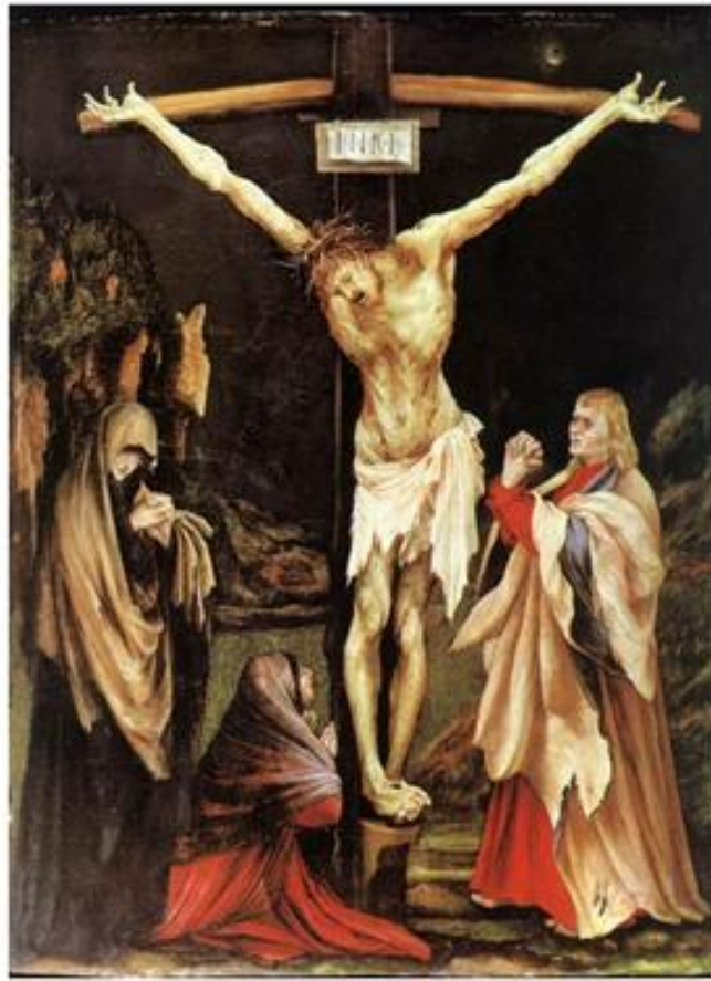
("The Crucifixion" Matthias Grunewald 1470-1528)

"Surely he has borne our griefs and carried our sorrows; yet we esteemed him stricken, smitten by God, and afflicted."